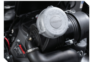
Turbinator® Pre-Cleaner - Exclusive feature removes debris for cleaner air