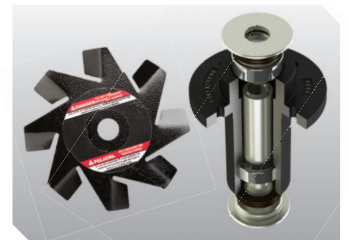
Spindle Package - Maintenance-free spindles and cooling fans come standard