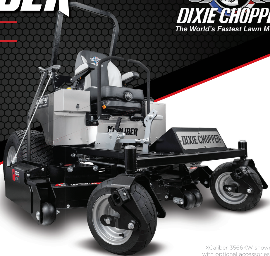
XCaliber 3566KW shown with optional accessories*