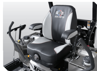
Total Comfort - Suspension seat with recline, lumbar, and padded armrests