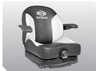
Suspension Seat - Full suspension for ultimate comfort all day long