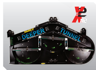
Wind Tunnel Deck - Increases airflow and reduces build-up under deck