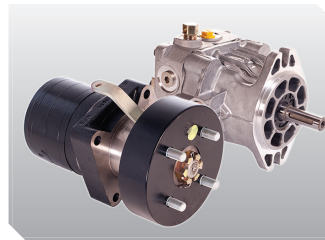
Pumps & Wheel Motors - Stronger transmissions for extended system life