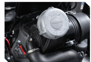
Turbinator® Pre-Cleaner - Exclusive feature removes debris for cleaner air