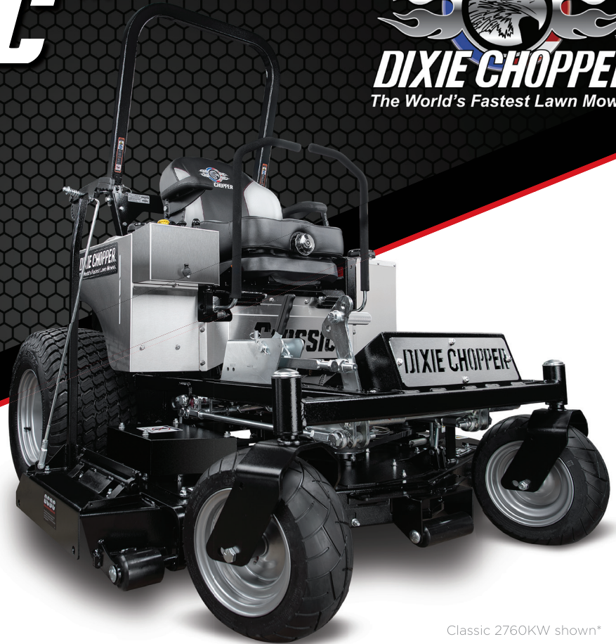
Classic 2760KW shown*